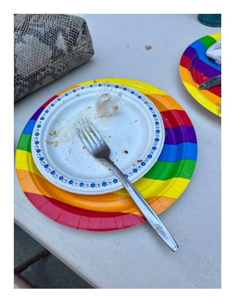
That's all folks!