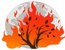
The Burning Bush Ex 3:1-12